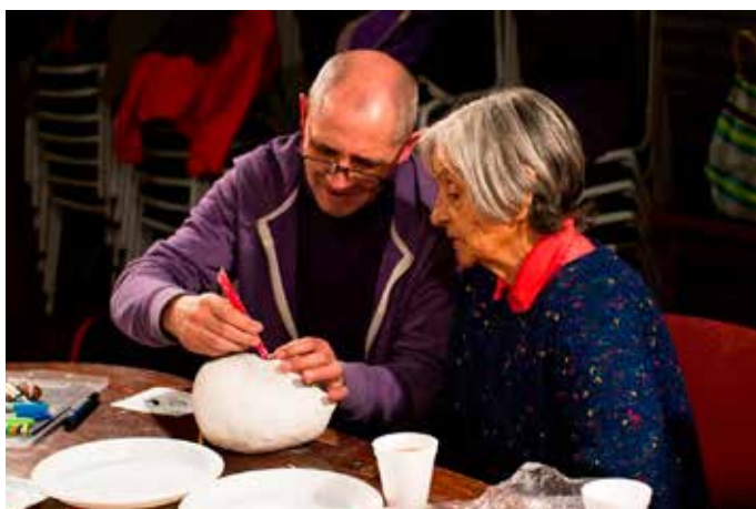
Creation and construction of the puppet inspired by her son.