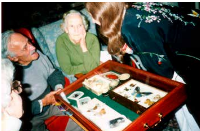
Butterfly discussion.