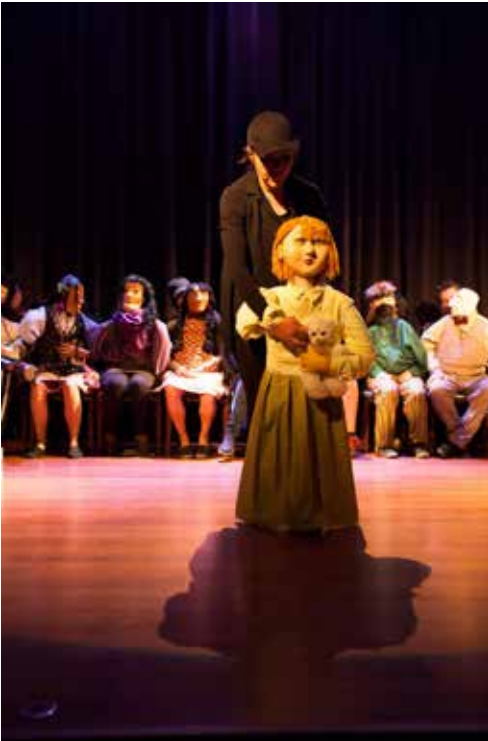
Final performance, “Puppets and Memory” workshop, Santiago, Chile. 2015.

“I would define the second stage as beginning with the construction (of the puppet). The wonderful illusion of bringing what was behind me, that I wanted to rescue from my life, into the present... I wanted to recover everything that could help me to go forward, and get rid of everything that had kept me in pain.”