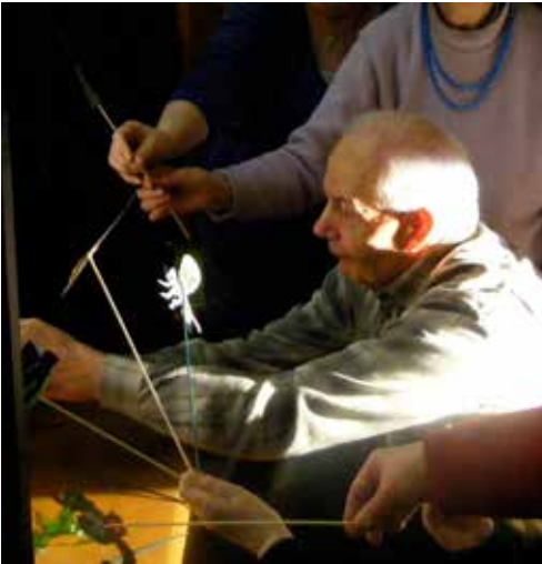
Shadow puppet group, Tain, Scotland.