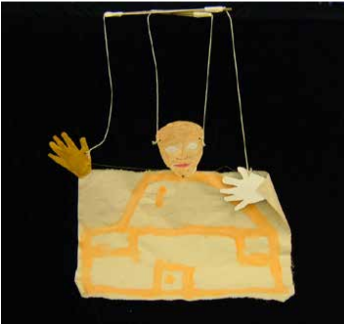
“Houseman” string puppet.

puppet consisted of a cardboard head and hands attached to a fabric rectangle which represented the body. The puppet was controlled by one set of strings attached to either side of the head and one set attached to each hand. I felt that this simple construction could be completed well within the time frame allocated and also within the capabilities of the group. I encouraged them to draw round their own hands in order to get a sense that the puppets were to be an extension of themselves however they interpreted that. I provided a cardboard template for the head as a starting point. A couple of boys asked me to draw their features on the faces so that they could paint them. One boy wanted to make a vampire puppet based on a character in a pantomime he had just seen. Another puppet became a “rock star”, another a “power ranger” character from a children’s TV series. They were encouraged to decorate the fabric “bodies” however they wished and beads, sequins, glitter, glue etc. were provided.