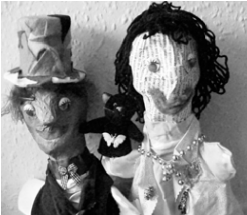
Mr and Mrs and Cat.