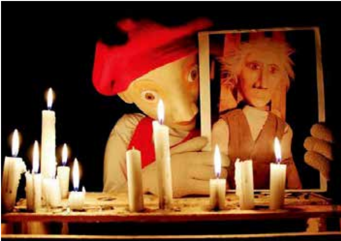
Scene from “Concierto para la Paz”.

of interpersonal and intergenerational dialogue. The experiences were characterized as interventions through puppet theatre, where the participants would carry out work involving forward-looking, representation and symbolization through the puppets. It would be possible to return to the traumatic experiences from the safe space offered by the puppet, as a mobilizing agent, promoting individual as well as group resignification, through collective dialogue with other people who have lived through similar experiences or have been affected transgenerationally by human rights violations.