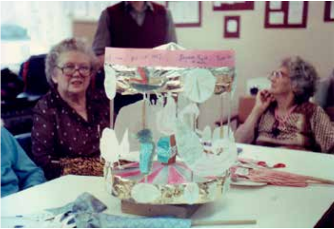
Merry go round.