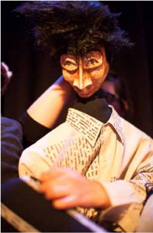
Finished puppet. "Puppets and Memory" workshop, Santiago, Chile. 2015.