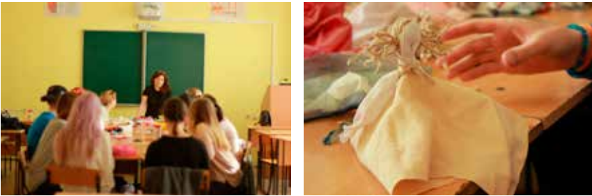
A Socio-Cultural Project “My Doll and Me” at the Russian State Social University. 2017.

psychology-workshop students get acquainted with major directions of modern science; art therapy, Gestalt psychology, Jungian psychology, and with forms of folk culture. Secondly, we should emphasize the psychological and cognitive outcomes associated with self-awareness, with the development of the practice of self-observation and self-knowledge, so necessary for successful work with people, and especially helpful to them. In the third place, the psychological and humanistic outcomes that open new possibilities of self-improvement. Fourthly, the technological results, consisting of the development of the simple and graceful technology of making “motanka”-dolls, which can also be used in situations not related to a psychology workshop. Fifthly, the results that come from the development of a free creative activity carried out in the specific subject area.