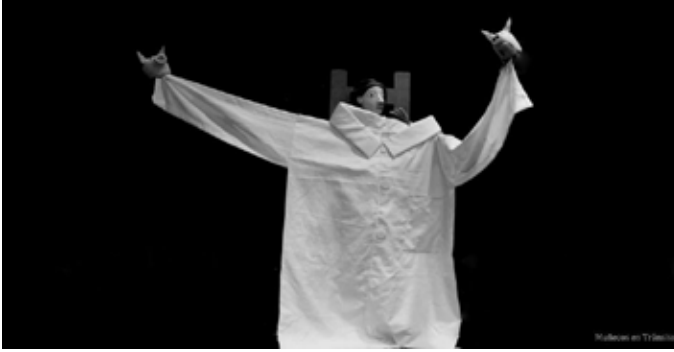
Scene from “Concierto para la Paz”.