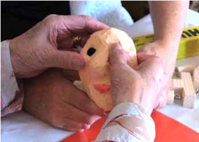
Inserting puppet eyes.

Maintaining a sense of identity and having the freedom to be ourselves are important factors in western culture, promoted by human rights thinkers in the late 1940's. This is not a simple matter, as our identities are constantly developing and we have several ways of being ourselves depending on our current needs or circumstances.