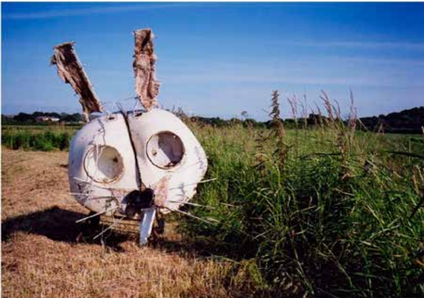
Bunny made from Scrap materials 2003, PickleHerring Theatre.

Listening centred practices as advocated by Suzi Gablik (1991) seem relevant to the way that puppetry can be applied to group settings. Listening to the people, space, objects and discourse without privileging one element is a demanding aim for the practitioner, but an approach that appears to be a way of opening up experiences, rather than delivering didactic learning exercises.