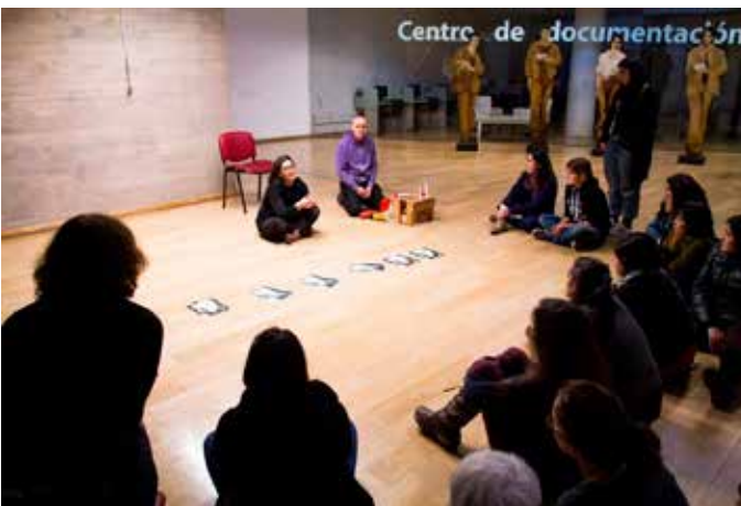
Fondart project 2015: "Puppets and memory" workshop launch. Memory and Human Rights Museum, Santiago, Chile.