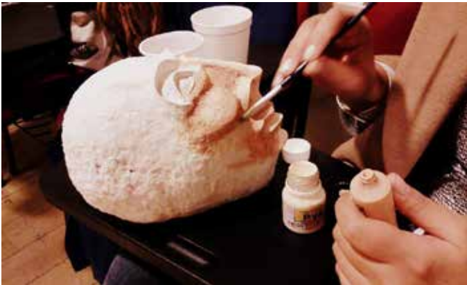
Puppet construction.

These are some of the elements that workshop participants mentioned when referring to their family memory story, where the absence of truth as well as extreme impunity had generated a double wound; on the one hand, profound absence, and on the other, absence of justice for their disappeared family members.