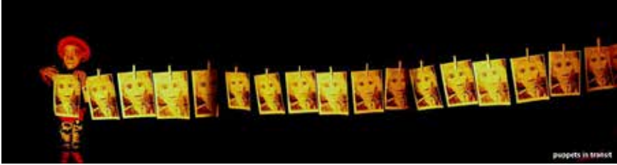
Scene from “Concierto para la Paz”.

We live within the discursive act. But we cannot presume that the verbal is the only matrix through which we can conceive the articulation and conduct of the intellect (Steiner, 2003, 13).