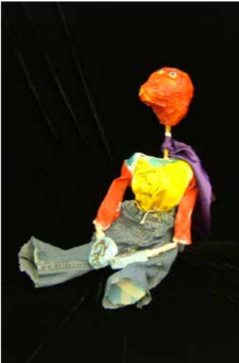
"Shadrach" rod puppet.

My name is Shadrach I am different I am scruffy but I don't care what people think of me I look around at the others in their white t-shirts and jeans and I look with pride at my purple cape and multicoloured t-shirt I want to be different I am imaginative and I can make people laugh If someone says something to me I just laugh at them and I walk away I am confident I can make a joke out of everything I live life to the full I am confident I am different.