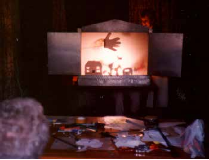
Shadows with elders.