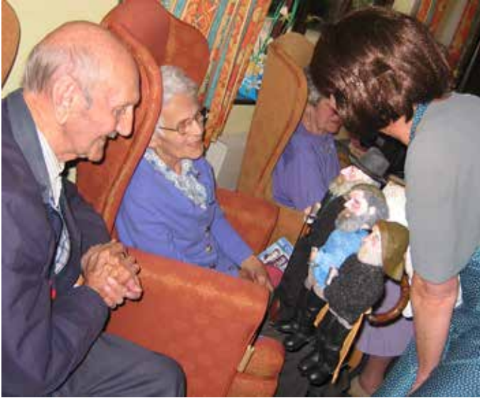
Looking at puppets.

It was often hard to tell how much was being absorbed, until we visited the audience and talked one-to-one. After the first very silent performance of Knowliddle a lady in the audience whispered to me. Was she trying to say something or just muttering? I put my ear closer and closer, and finally heard, “Did you make the puppets yourself dear?”