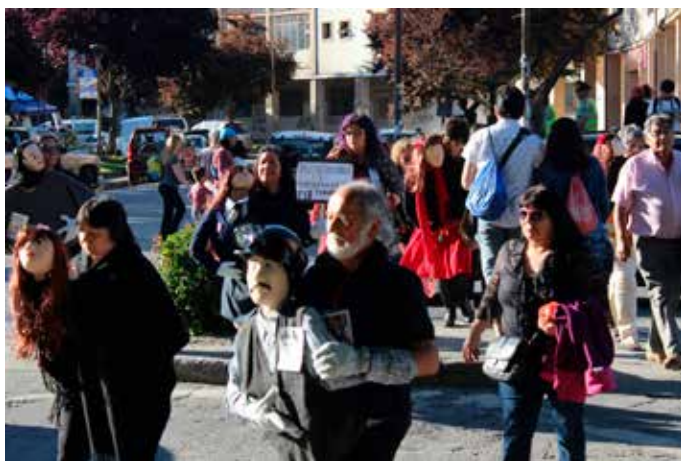
Final performance, “Aesthetics of Memory and Transgenerational Damage” project workshops in Lota and Concepción, Chile. 2017.