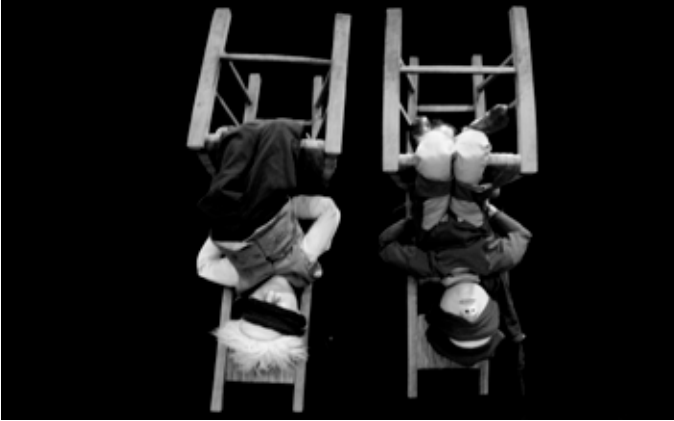
Scene from “Concierto para la Paz”.

because we saw the empathy and connection that this moving material created in the audiences.