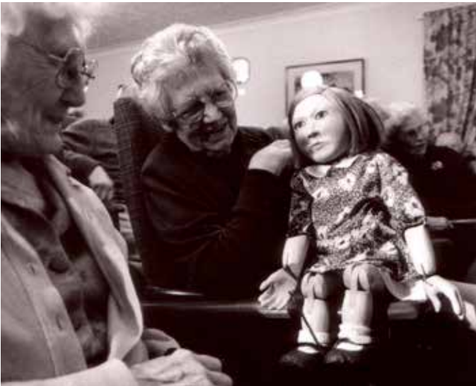
Puppets and ladies.

As many people had difficulty moving about, we took puppets and artefacts from the show into the audience after the performance, and listened to their stories. We encouraged them to discuss the issues and add their own memories. Sometimes a debate would ensue. "I think your mother's decision to keep the story of her mother's mental illness a secret was the right thing to do." – "I don't agree! It's always better to be open, especially with children."