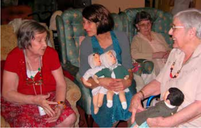
Looking at puppets 2. Credit Jules Carpenter.

it a child, or a machine, a male or a female? (Even though it was clearly made of plastic and metal, had two people controlling it, and barely resembled a human being.)