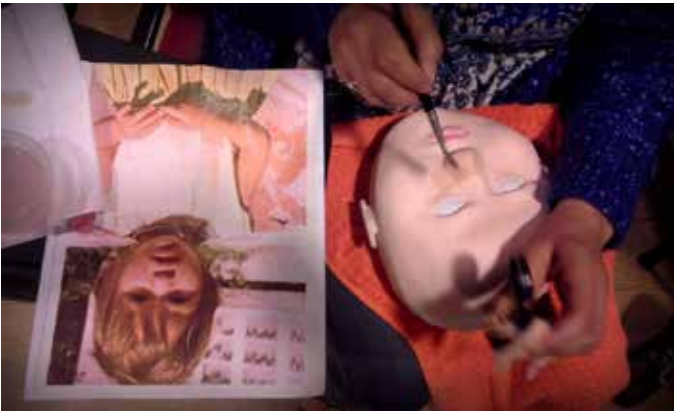
Photo inspiration for the puppet. “Puppets and Memory” workshop, Santiago, Chile. 2015.