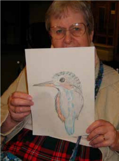
Drawing of Kingfisher. Credit Jules Carpenter.

Some simple advice from venues on the physical and emotional needs of participants was helpful, such as their ability to move about, see, hear etc. but too much information about people's ailments, and assumptions about their capabilities could be very misleading. Better to use intuition and think of participants primarily as people – not “cases” – and trust that involvement in creative arts, especially puppetry, can engage even the most frail individuals, and access deep levels of memory.