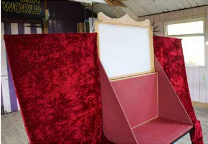
Shadow screen front view.

My second example of working in this sector had an unexpected outcome. In 1994 I ran shadow puppet workshops for Shape Suffolk with Occupational Therapists in day centres for older people with mental health issues. At Ipswich Heath Road Hospital the OTs' understanding of the capabilities of their clients with organic (e.g. dementia), or functional disorders (e.g. illnesses such as chronic depression) was turned on its head. "We'll probably only manage one session with the 'organics,'" they said, "but the 'functionals' will be fine". However, the "functional" people were too slowed down by drugs to show much enthusiasm, getting me and the staff to cut out, perform, and play with percussion instruments. Whereas the "organic" people enjoyed themselves enthusiastically, joined in with everything, went back to the day room and told people what they had been doing, and came back for more the following weeks. (These were people with various forms of dementia, involving short term memory loss.)