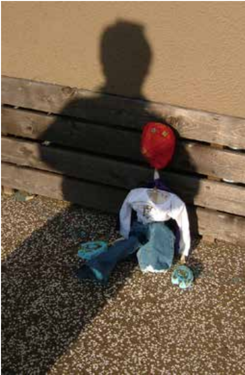
Shadrach and his maker.

Puppets protect: what is expressed can be denied and blamed on the puppet, so that inner worlds are revealed in non-threatening ways. Puppets can do things and change things in ways people can't. This transformational quality is also what puppets offer to people: they can help people do things they can't do unaided in self-exploration, self-expression, and individual or social change. Puppets enable access – access to one's inner life, thought processes, creativity and social change; language is extended (Bernier, 2005, 122).