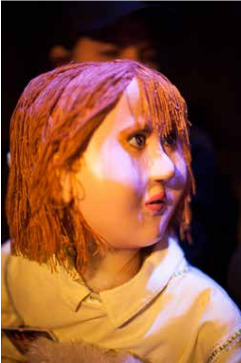
Finished puppet. “Puppets and Memory” workshop, Santiago, Chile. 2015.

reparation... therefore the wounds have remained silenced and hidden. So, I turned all that into the materialization of my puppet, which relays in written form some of the moments of his story, and my story in its costume.”